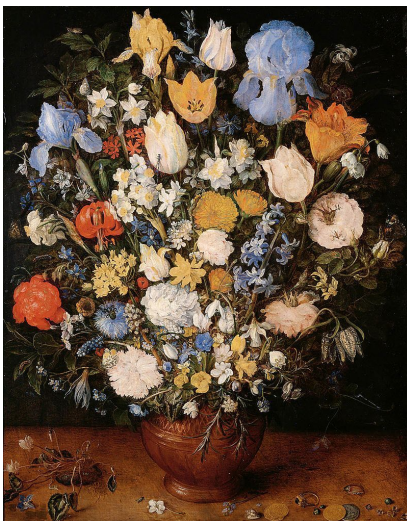
Bouquet, 1599 Jan Brueghel the Elder